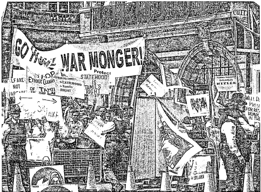
Plate 6.1 Opposing demonstrations by expatriate Tamils and Sinhalese outside the Commonwealth Secretariat in London, 10 June 2008

opposition movement that many Tamils consider to be an authentic expression of resistance to oppression by the Sinhala-dominated Sri Lankan state, as a terrorist organization, a process that has intensified since the beginning of the war on terror. The implications of this designation and the conflicting ideas of legitimacy and resistance that it calls into play are well exemplified by Plate 6.1, which shows opposing demonstrations by expatriate Tamils and Sinhalese that took place on 10 June 2008 outside the Commonwealth Secretariat in London while Sri Lankan President Mahinda Rajapaksa was meeting other leaders. The Tamils, protesting against '60 years of oppression' demonstrated in support of self determination while the members of the Sinhala community challenged the legitimacy of this demand. While the nature of relationships between Western states, the Tamil diaspora and the politics of proscription is considerably more complex than is suggested by this picture, it captures some of the contradictions in the British state's approach to Sri Lanka's conflict: whilst the UK deems the LTTE a terrorist organization using violence against a multicultural democracy, British police erect barricades to separate the polarized Tamil and Sinhala communities.